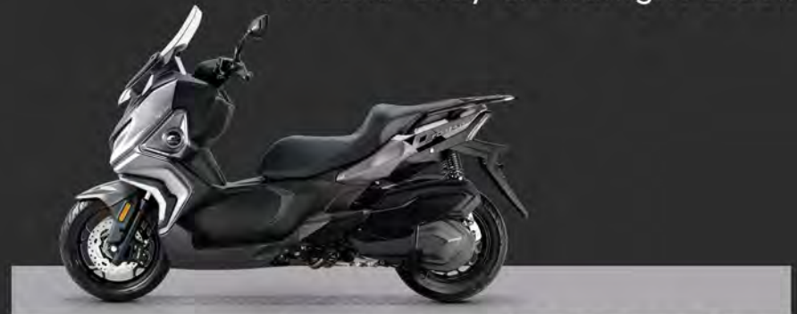
Cosmic Gray & Midnight Black