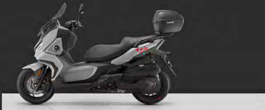
Space Silver & Day-Night Black