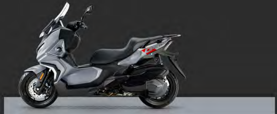
Mecha Gray & Midnight Black